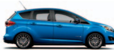
Blue Candy Metallic Tinted Clearcoat