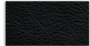
4 Charcoal Black Leather