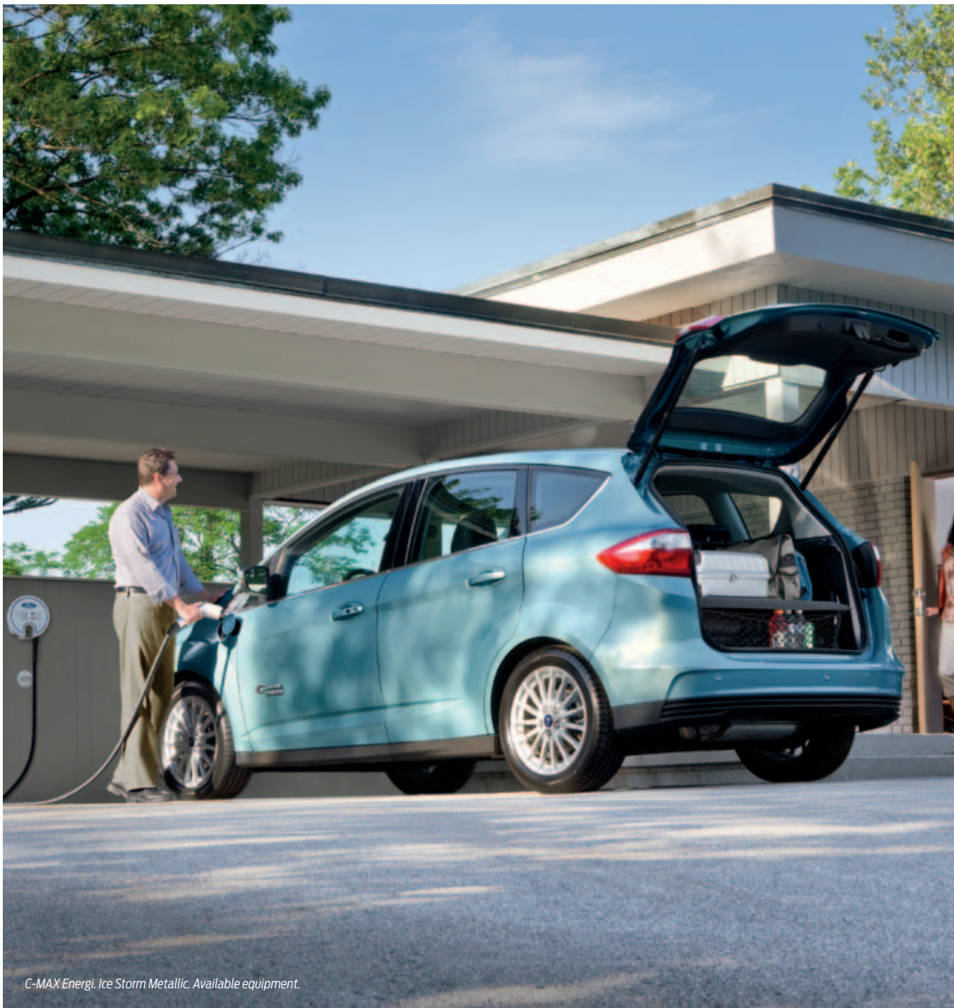
C-MAX Energi. Ice Storm Metallic. Available equipment.