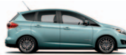
Ice Storm Metallic