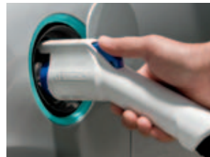
External charge port with LED-illuminated state-of-charge indicator.