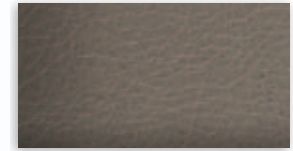
3 Medium Light Stone Leather