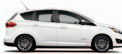
White Platinum Metallic Tri-coat