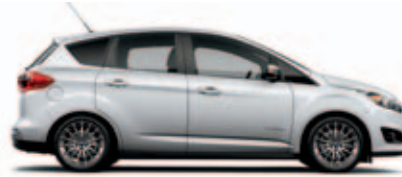
Ingot Silver Metallic