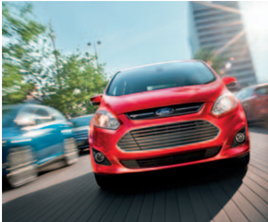
Ruby Red Metallic Tinted Clearcoat. Available equipment.