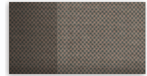
1 Medium Light Stone Cloth with Medium Dark Stone Accents