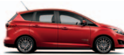
Ruby Red Metallic Tinted Clearcoat