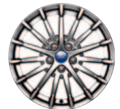
17" Machined Aluminum Standard