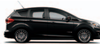
Tuxedo Black Metallic