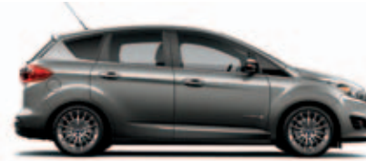
Sterling Gray Metallic