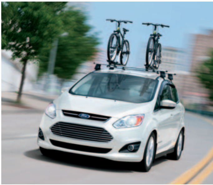
C-MAX Hybrid SEL in White Platinum Metallic Tri-coat customized with roof-mounted crossbars and bike carriers by THULE® 1 smoked side window deflectors and molded splash guards