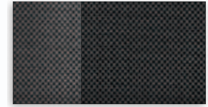
2 Charcoal Black Cloth with Warm Steel Accents