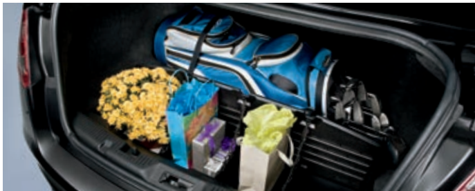
SE. Deep Impact Blue. SEL. Ingot Silver. Available equipment.