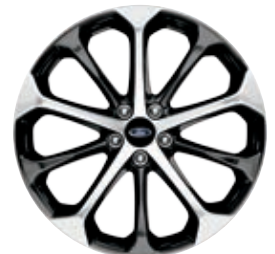
20" 10-Spoke Machined and Low-Gloss Ebony-Painted Aluminum Available (no additional charge on SHO)