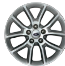
17" Sparkle Silver-Painted Aluminum Standard: SE

2.0L EcoBoost I-4 engine with 6-speed SelectShift automatic transmission with Sport Mode and shifter button activation (n/a with AWD) 20" 10-spoke machined and low-gloss ebony-painted aluminum wheels with P245/45R20 all-season tires (requires 201A) All-weather floor mats All-wheel drive (AWD) Ash cup/coin holder with lighter element Cargo organizer Leather-trimmed seats with heated front seats Power moonroof (requires 201A) Rear decklid spoiler Voice-activated Navigation System with integrated SiriusXM Traffic and Travel Link ® with 5-year subscription (requires 201A)