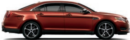
Bronze Fire Tinted Clearcoat Metallic