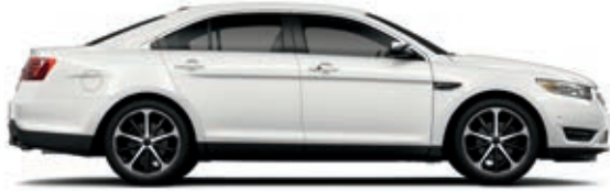
White Platinum Tri-coat Metallic