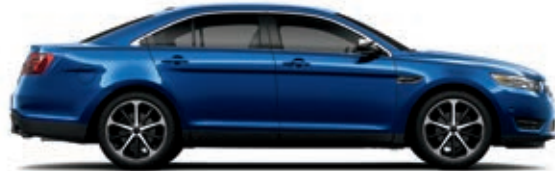
Deep Impact Blue