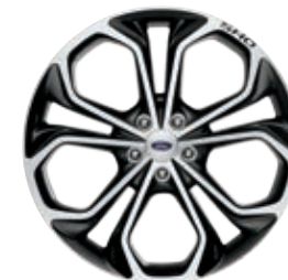
20" Machined and Painted Aluminum Standard