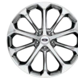
20" Polished Aluminum Optional