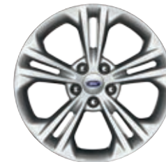
18" Sparkle Silver-Painted Aluminum Standard: SEL