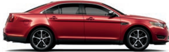
Ruby Red Tinted Clearcoat Metallic