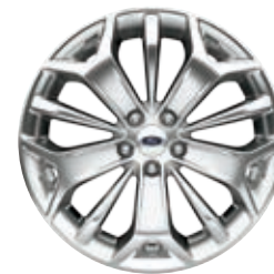
19" Premium Luster Nickel-Painted Aluminum Standard